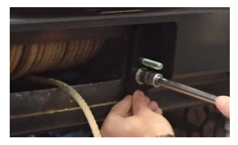
*DEPENDING ON WINCH HARDWARE, LONGER BOLTS MAY BE REQUIRED

3. Loosely fasten plate & bolt assemblies to lower mounting positions of winch using hardware supplied with winch.